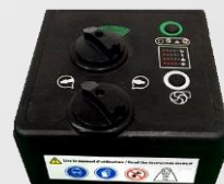
Control Box Model 300 Heated