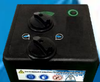
Control box Model 100 Not heated

US 9,370,800 B2; CA 2,784,300; EU 2,521,624