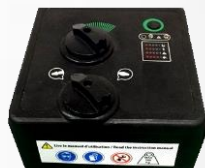
Control Box Model 500 Heated + Venturi