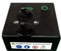
Control box Model 100 Not heated