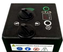
Control Box Model 300 Heated