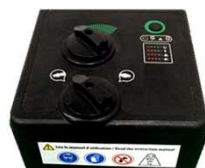
Control Box Model 500 Heated + Venturi